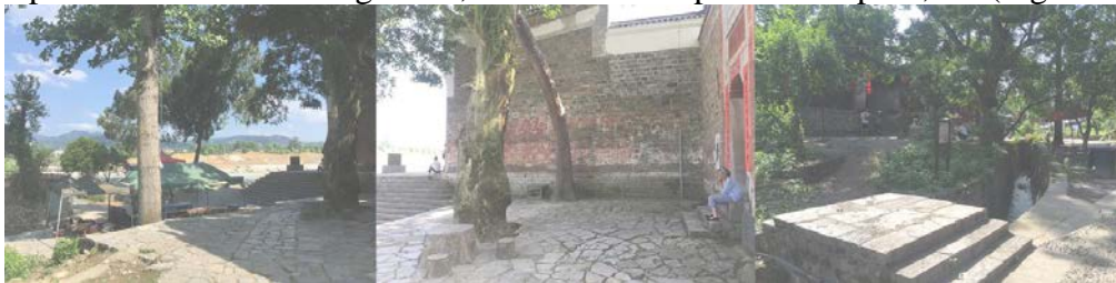
Figure 2. Current situation of the entrance

(1) Current situation of the site: as the only way to enter and exit the ancient village, it is also a gathering place. The existing layout of the entrance basically meets the functions of entrance and exit, distribution, etc. Moreover, due to the good microclimate environment under the Seven Star ancient trees, the utilization rate of the area is very high, but the landscape effect needs to be strengthened, such as the lack of public rest facilities under the trees, the style of seats and the overall style of the village are not in harmony; the shed used for sale at the entrance seriously affects the traffic and entrance image; the middle channel is deep without guardrail, which has certain potential safety hazards; the plants are lack of management, and the landscape effect is poor, etc (Figure 2).