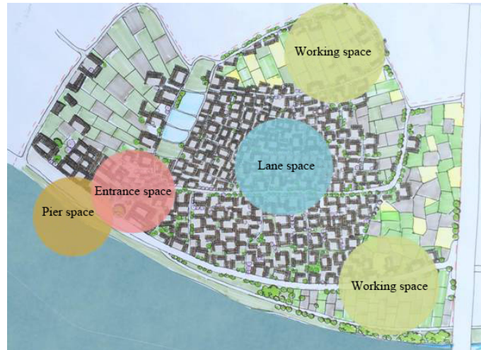
Figure 1. Typical node distribution