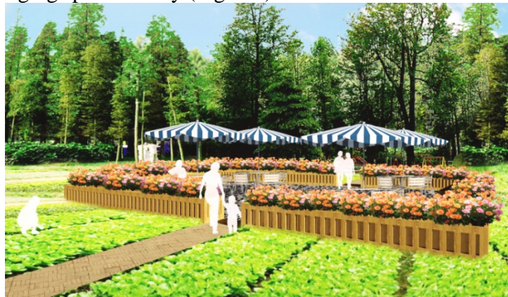
Figure 7. Working space optimization effect with "light intervention"

(3) Analysis on the optimization effect of "light intervention": To create a work and rest space and consider the introduction of weekend vegetable garden, work school and other ways can not only meet the needs of temporary rest of villagers, but also increase the interaction and participation of tourists and places, bringing space vitality (Figure7).