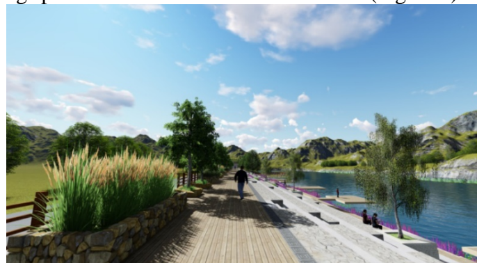
Figure 6. Pier space optimization effect with "light intervention"

(3) Analysis on the optimization effect of "light intervention": The introduction of hydrophilic space and the intervention of functional stand space can reproduce the symbiosis of Wushui and Jingping in history, which can not only arouse the villagers' memories of the old times, but also enrich the villagers' living space and meet the needs of activities (Figure 6).