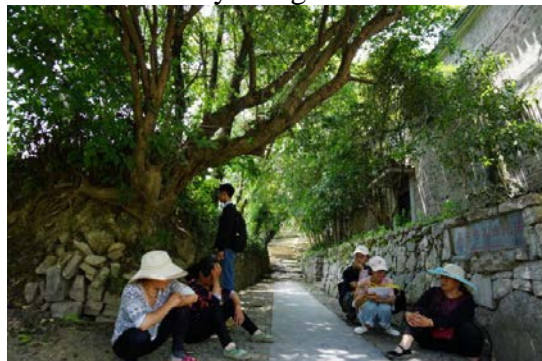
Figure 4. Villagers sit on the ground and talk at the crossing

(1) Current situation of the site: due to the change of the height width ratio of the buildings on both sides and the road, the ancient village roadways have rich space opening and closing feelings. Combined with the current situation of the village's "Acquaintances" neighborhood, the villagers may talk for a while when they meet on the road. The roadways are obviously short of parking space, especially the roadways with beautiful scenery and good microclimate (Figure 4).